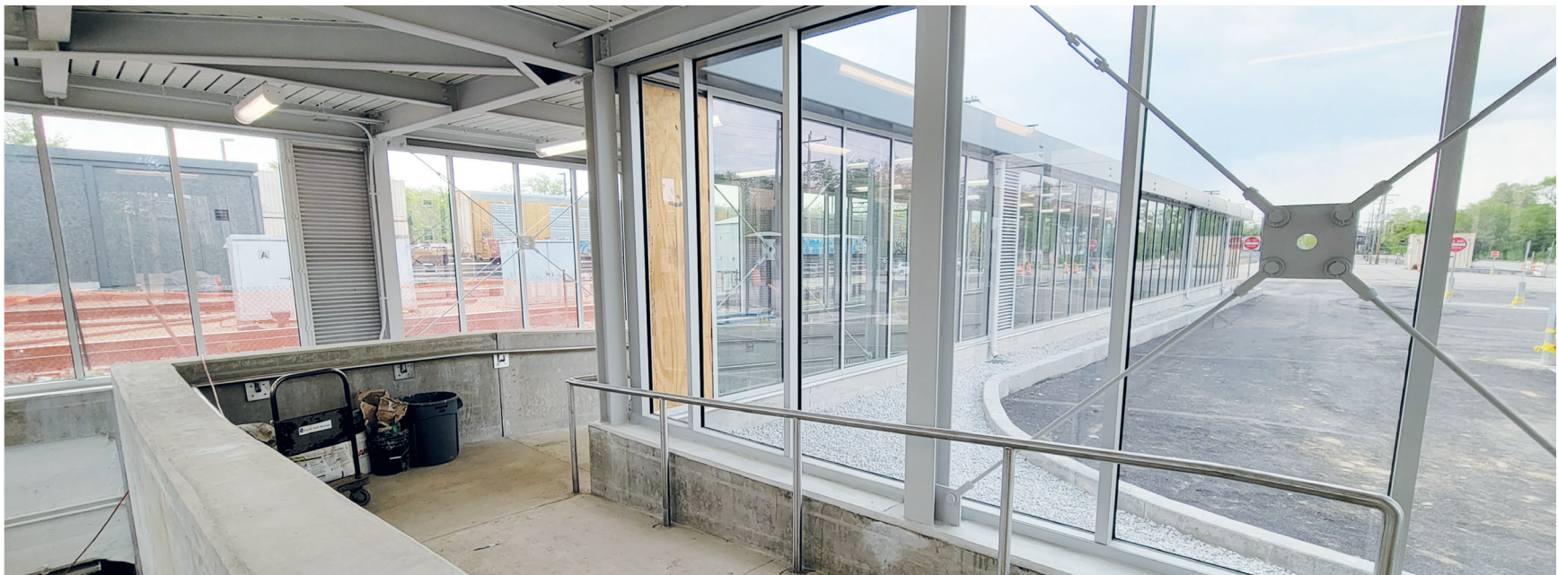
The enclosed ramp on the west side of the Homewood train station will provide better access for passengers, especially those with mobility challenges.