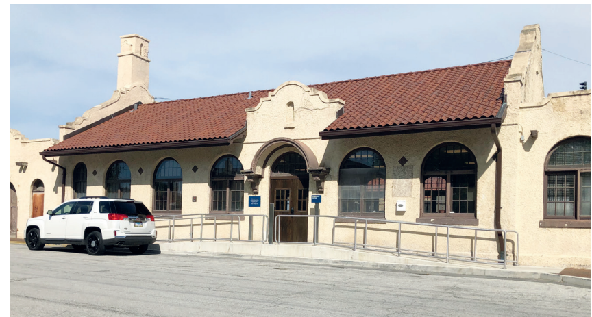
Amtrak made major interior and exterior improvements to its Park Avenue station, including a new tile roof and improvements to make the century old station ADA compliant.