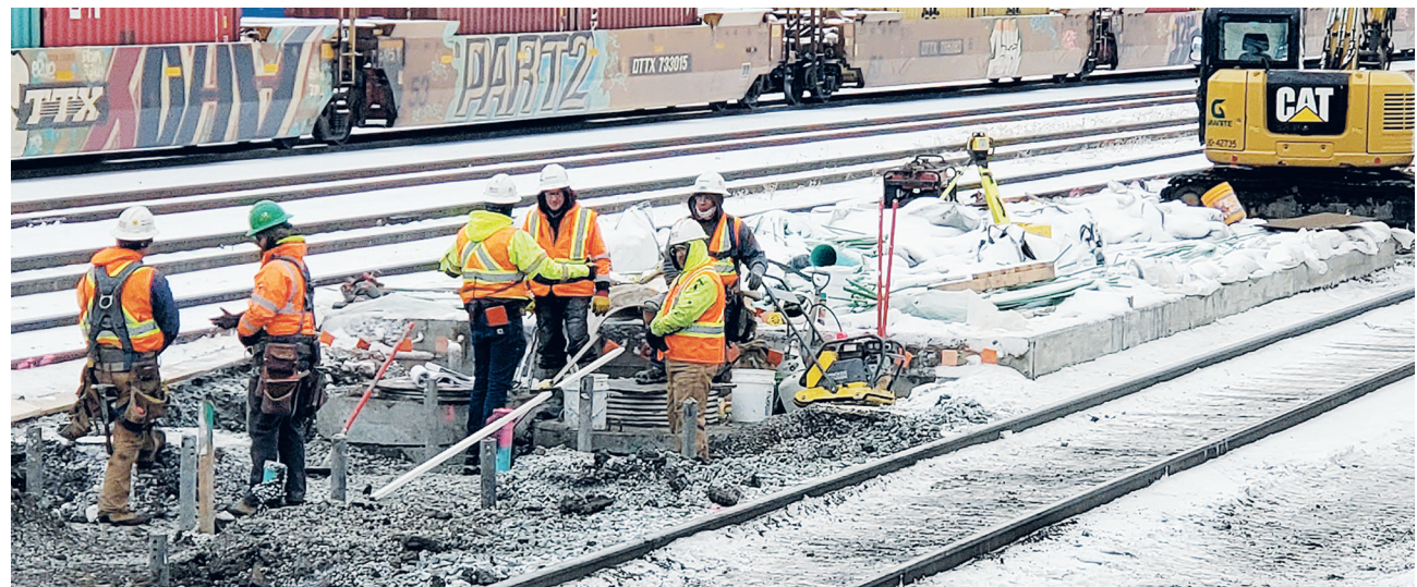
Construction crews work on a snowy day in January 2021, rebuilding the Amtrak boarding platform. The completion of the two-year project will be celebrated June 25.

drainage and ventilation. A graffiti-resistant finish will be applied.